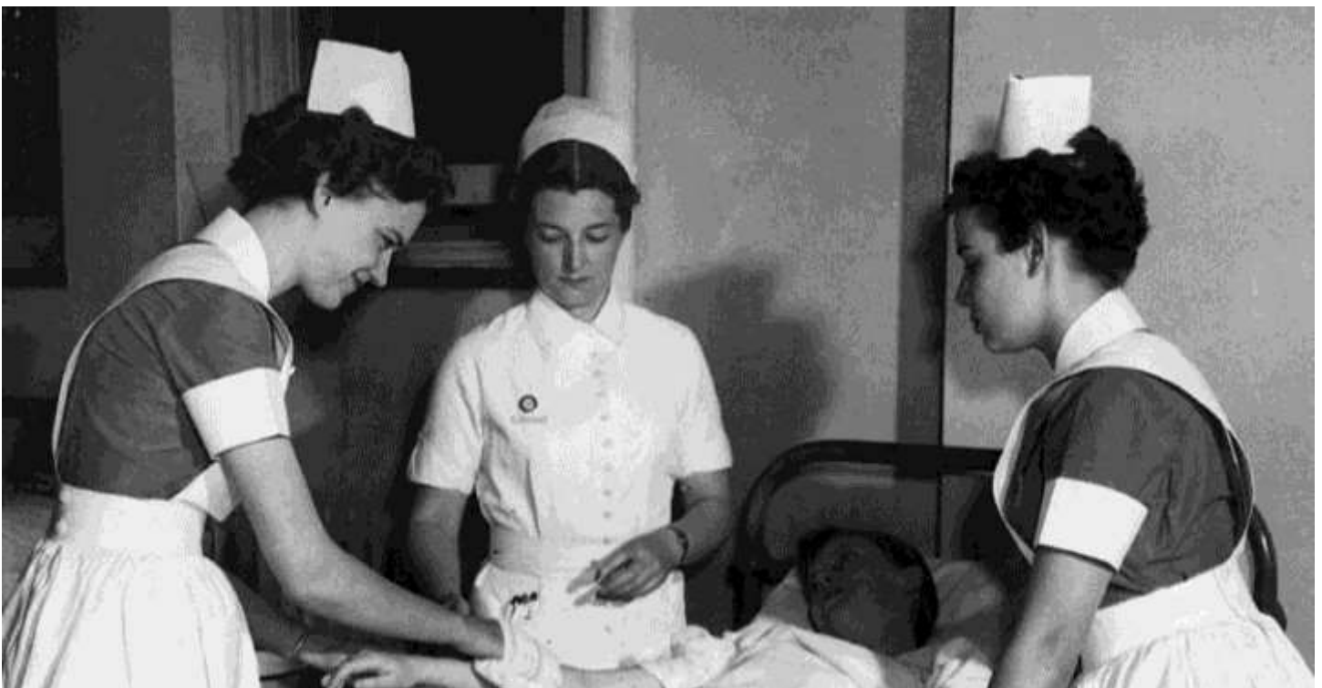
[Photograph of a nurse observing as a nurse in training tends to a patient's arm at the School of Nursing at Sherbrooke Hospital.]