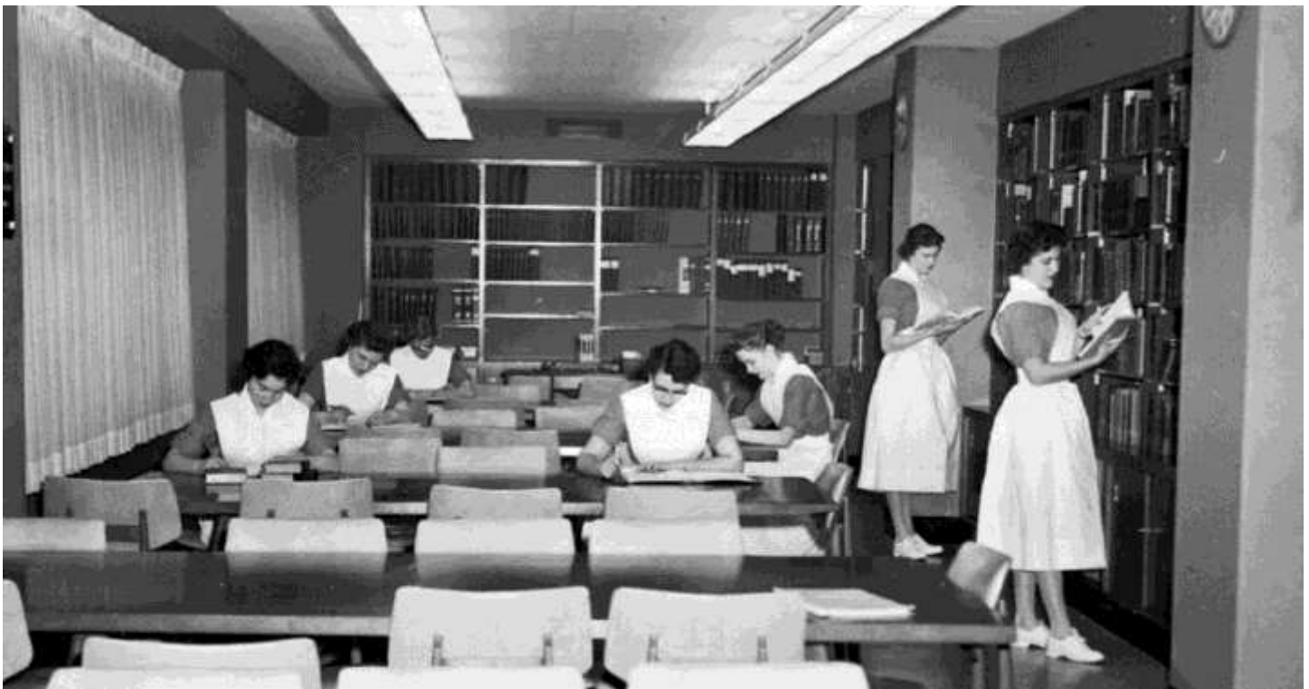
[Photograph of nurses-in-training working in the library at the Winnipeg General Hospital's School of Nursing.]