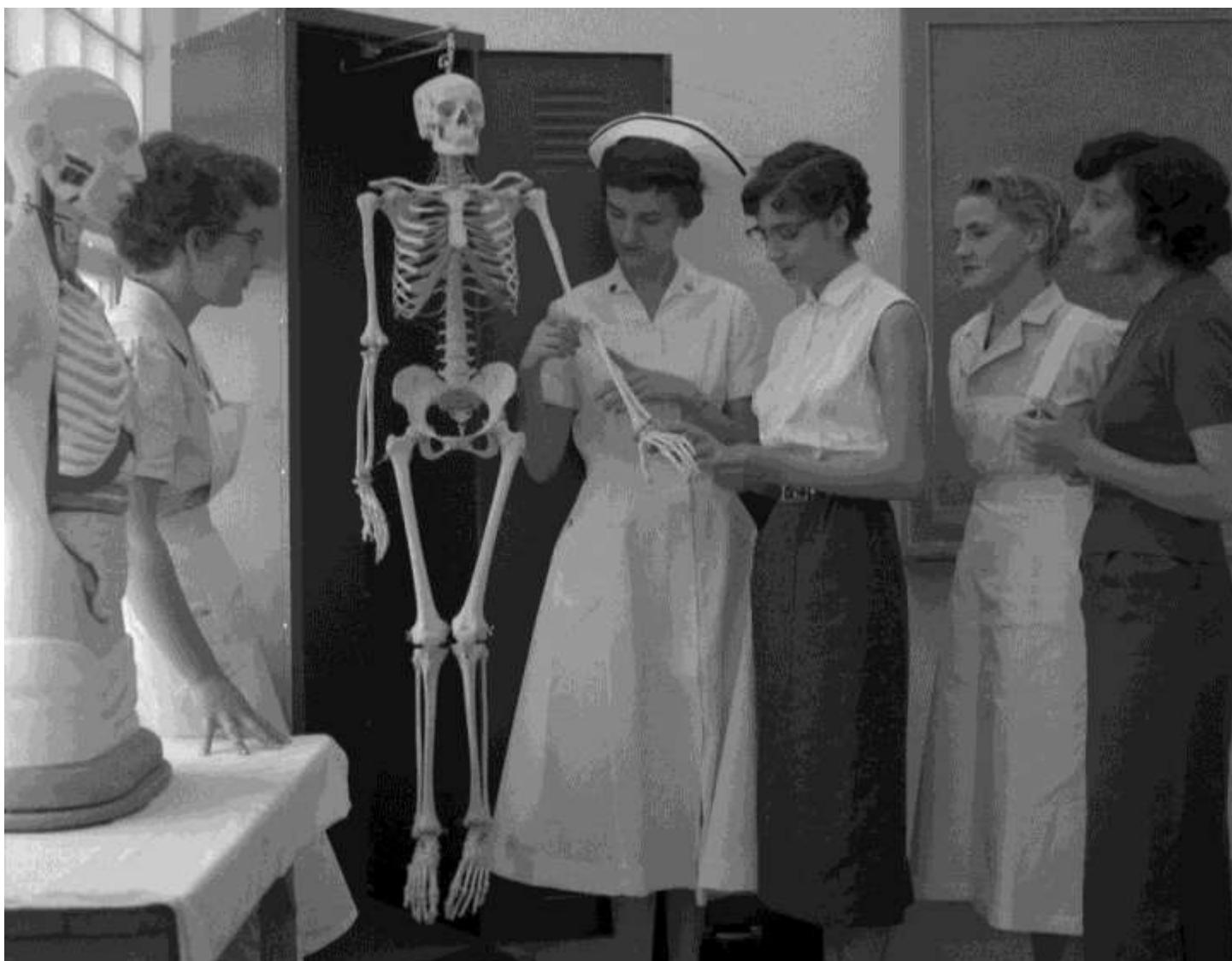
[Photograph of nurses looking at skeleton.]