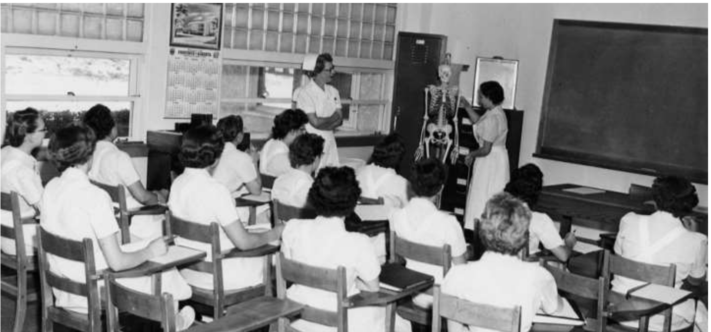
[Photograph of an anatomy class in progress.]