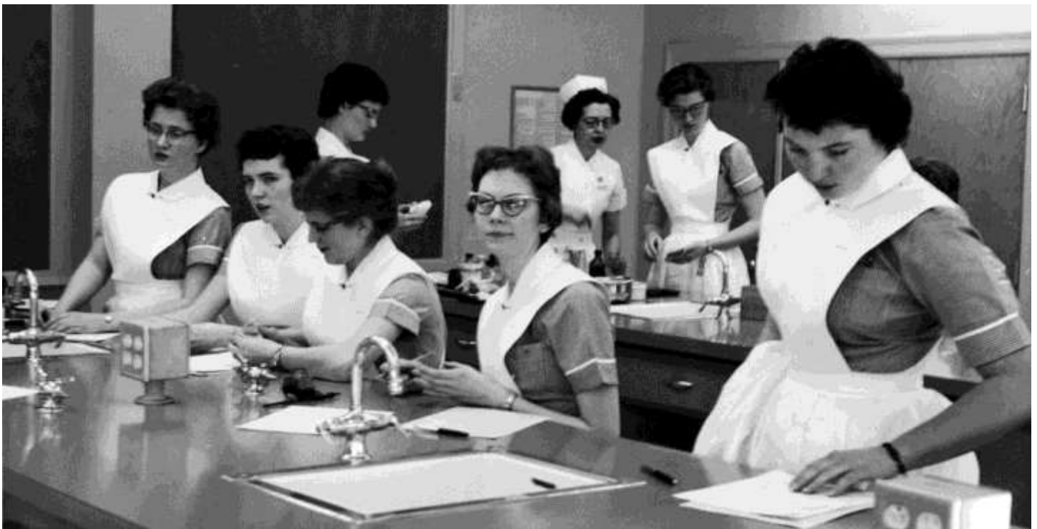
[Photograph of a nurse instructing students at the University of Alberta Hospital.]