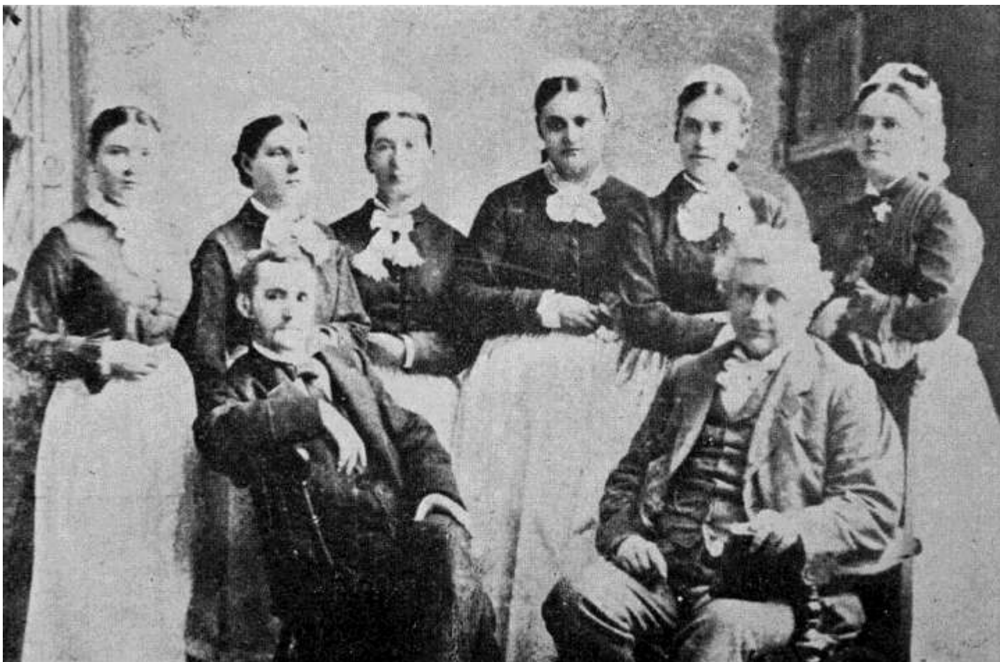
[Photograph of staff and first graduating class of the Mack Training School for Nurses, 1878.]