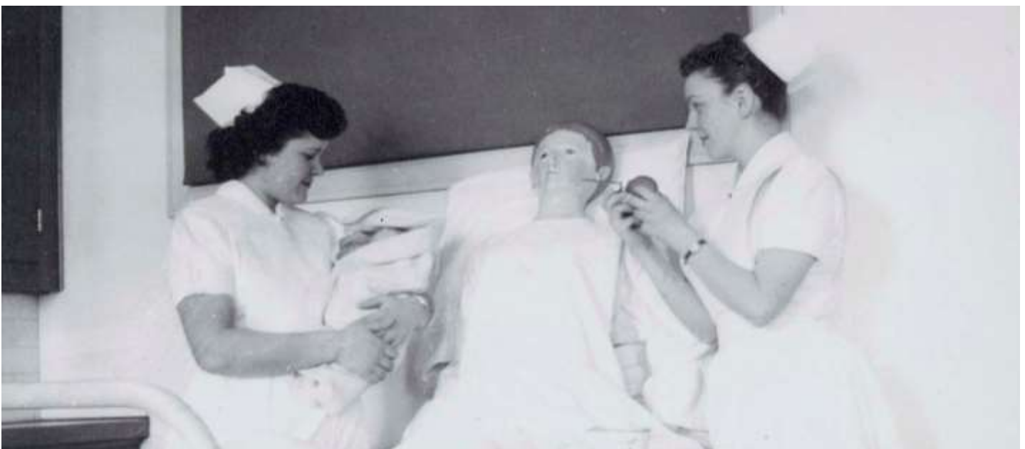
[Photography of a class demonstrating procedures on dummies in St. Boniface School of Nursing, 1949].

In 1985 Council addressed two key issues that were being discussed in the debates around the country on the question: the quality of the numerous programs that would be required to meet demand, and the fate of the diploma-nurses. At the November 1985 Council meeting, two motions were passed; the first called for “extending generic programs,” while the second called for “primacy [to] be given to the development/expansion of baccalaureate programs for post-diploma nurses.” ([CASUN], [Untitled minutes of November 7 & 8, 1985 Council meeting], [ca. 1985]).