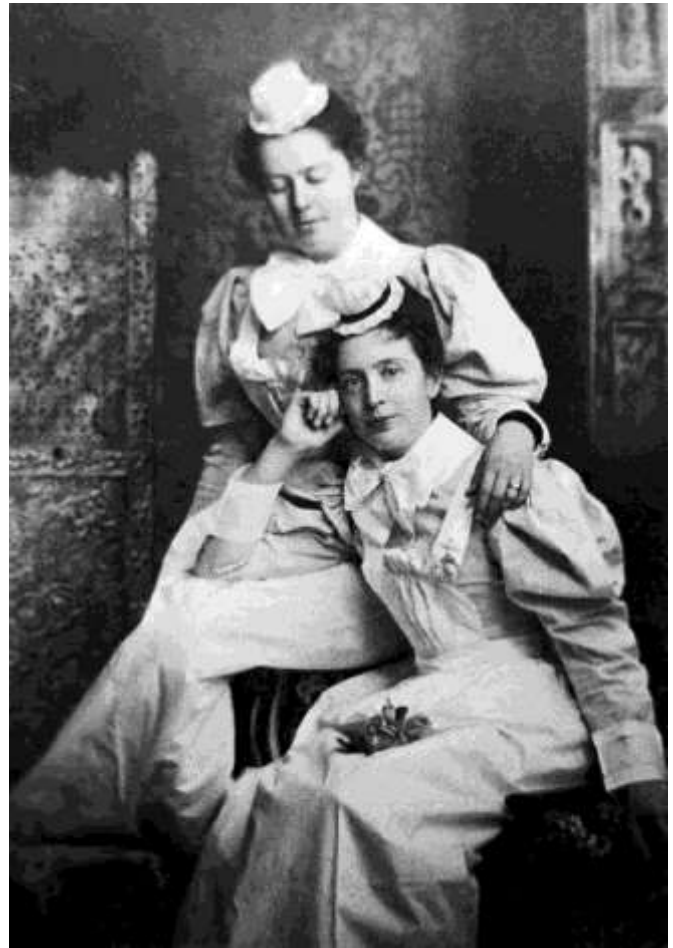
[Photograph of two nurses from the John H. Stratford Hospital Training School for Nurses (later re-named the Brantford General Hospital School for Nurses) in their student nurse uniforms.]