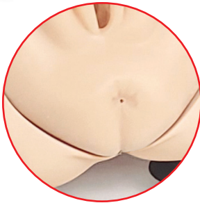
Enema and rectal suppository training