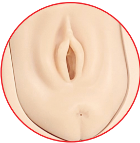
Soft touch silicone skin