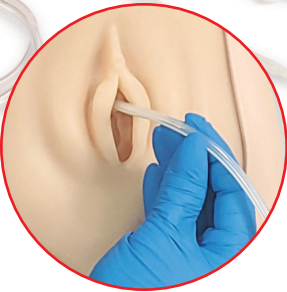
Suprapubic catheterization training