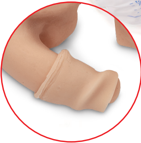
Removable foreskin (male)