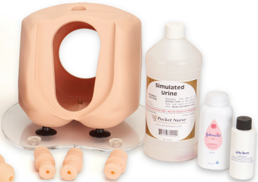
Updatable/upgradeable for long-term usability