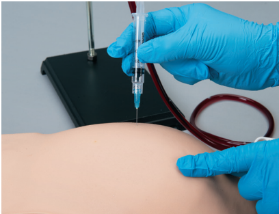
Deltoid muscle injection sites