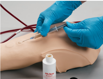
Noticeable “pop” as needle enters vein