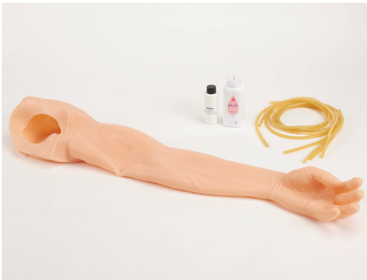
Replaceable skin and veins for long-term usability