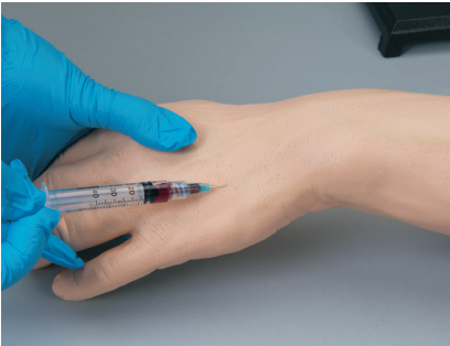
Realistic skin texture