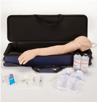
Assorted skin tones available