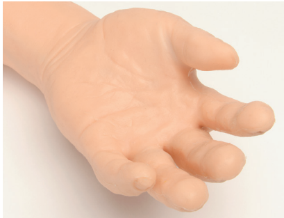
Soft, flexible fingers and wrist