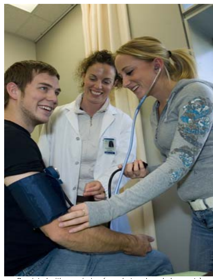
Reprinted with permission (see photo acknowledgements)