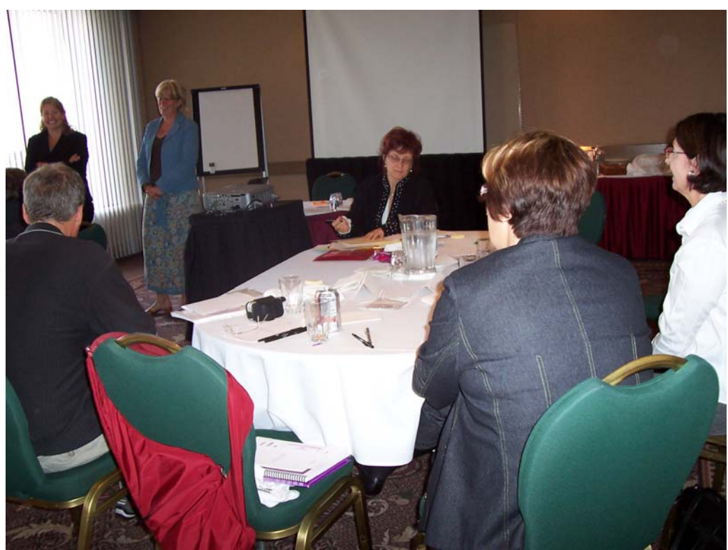
Accreditation Reviewer Orientation – September 2007