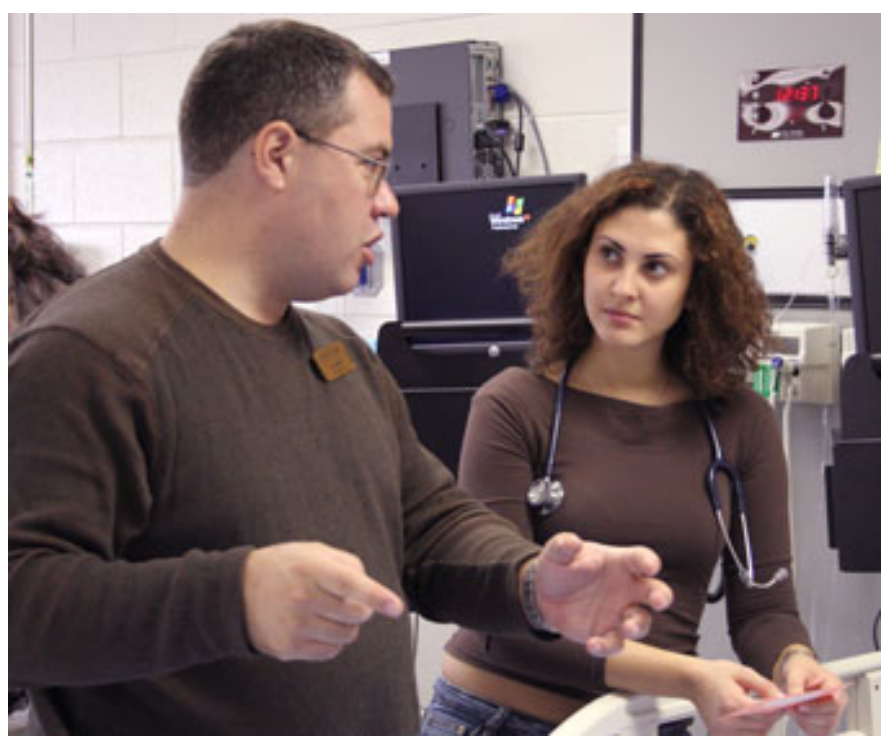
Reprinted with permission (see photo acknowledgements)

CASN's mission is to lead nursing education and scholarship in the interest of healthier Canadians.